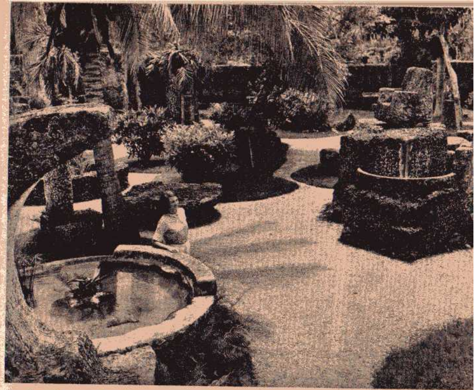
Coral garden was part of strange construction the eccentric created over 30-year span.

wonderland of rocks hewn into hundreds of shapes and objects. Again, with just a finger, you can set in motion rocking chairs weighing thousands of pounds. There's a 15-foot-long table with its top carved into the shape of the state of Florida. Another table has the form of a heart from which a flowering centerpiece blooms. There are couches, beds and a bathtub all sculptured from solid coral slabs.